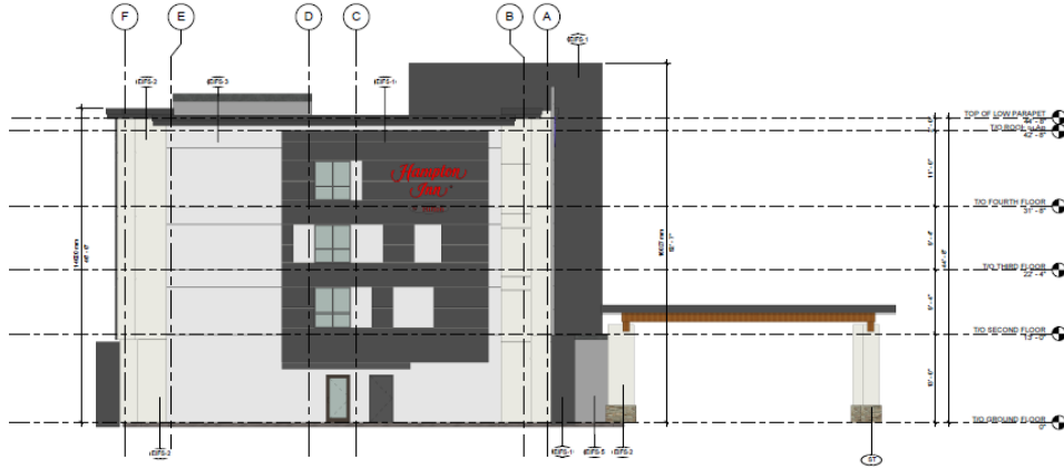
East Elevation (View from Henderson Street)