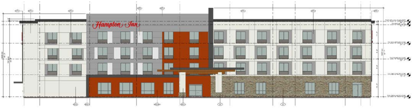
North Elevation (View from Pemberton Road)