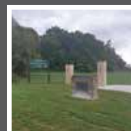
Town Park Gates