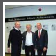
Wall of Honour